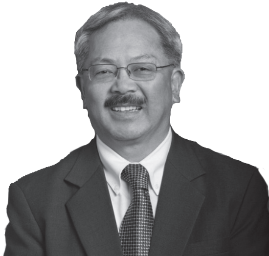
Ed Lee, 43rd Mayor of San Francisco

Community Engagement Efforts to Engage Residents & Help Balance City Budget; New SFOpenBook Gives Greater Transparency in City's Revenue & Spending